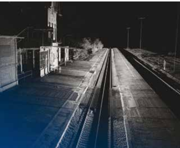
Sample data of the Wangen station captured within a few seconds

A hardware-assisted pixel-by-pixel synchronization, already used and tested in previous models, makes it possible to process external signals to determine the position of the scan data.