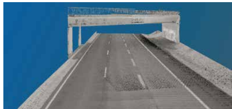
Sample data of a highway